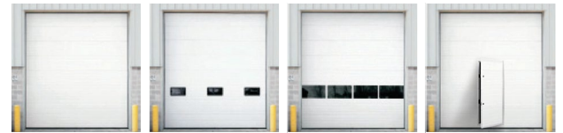
MODEL U100 closed door